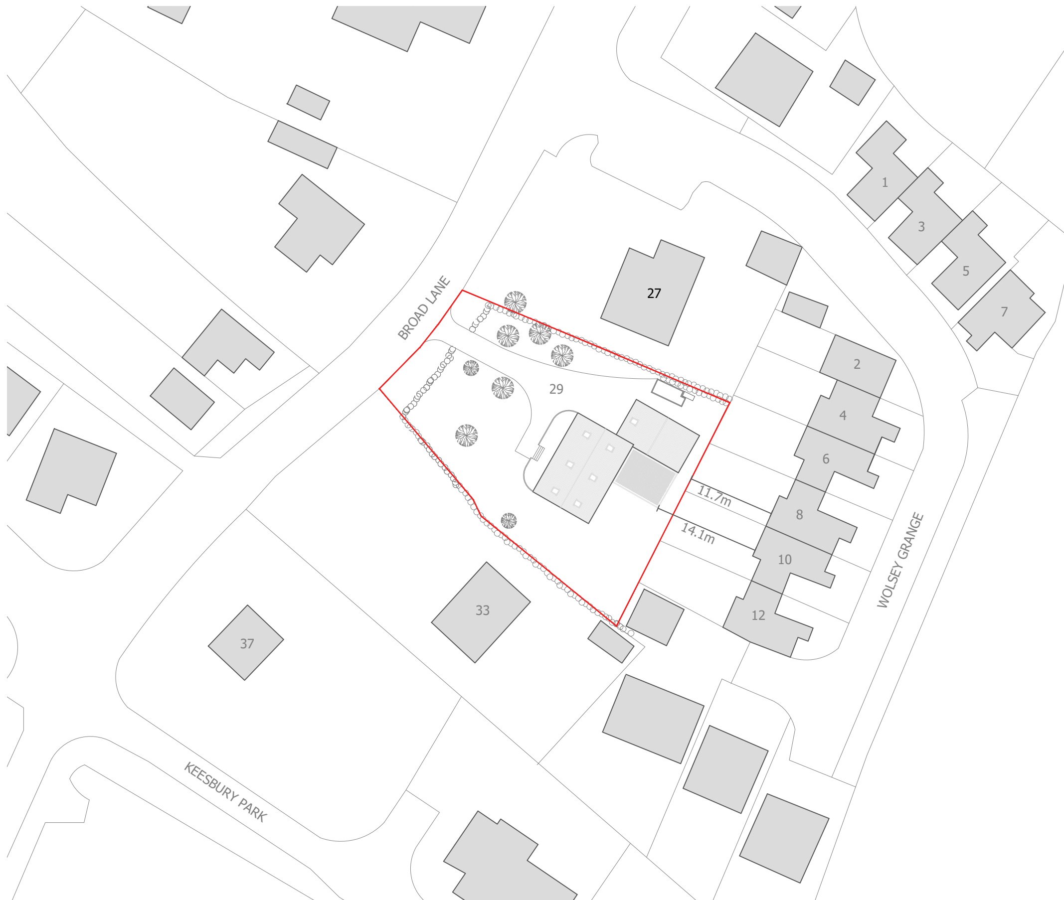
PROPOSED SITE PLAN 1:500 *All dimensions are taken from OS data