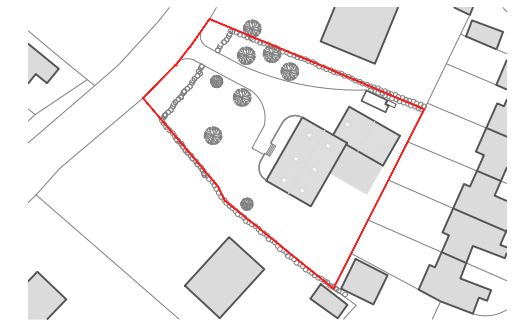
SITE LOCATION 1:1250 *All dimensions are taken from OS data